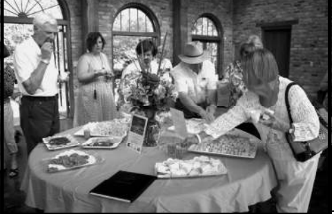
Reflections and Visions

Right and bottom: Photographs of the Art in the Garden and Wine Tasting event.