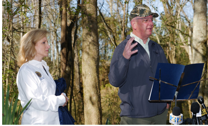
Governor John Bel Edwards announces the creation of a statewide taskforce on litter abatement and beautification.