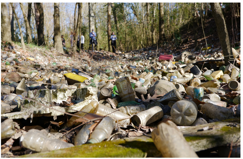
Over 81 tons of garbage have accumulated in the wetland of Burden Museum and Gardens.

Another significant reason for this accumulation of litter in our watersheds is that the state of Louisiana has one of the highest annual average rainfalls of any state, approximately 60 inches per vear. Stormwater carries the litter that accumulates on our streets into storm drains that empty into our canals, creeks, bayous, lakes and wetlands. It collects in all these parts of our watersheds or continues to be carried downstream. Downstream of East Baton Rouge Parish, the stormwater flows primarily to Bayou Manchac to the Amite River to Lake Ponchartrain to the Mississippi River and, finally, to the Gulf of Mexico. This litter is not