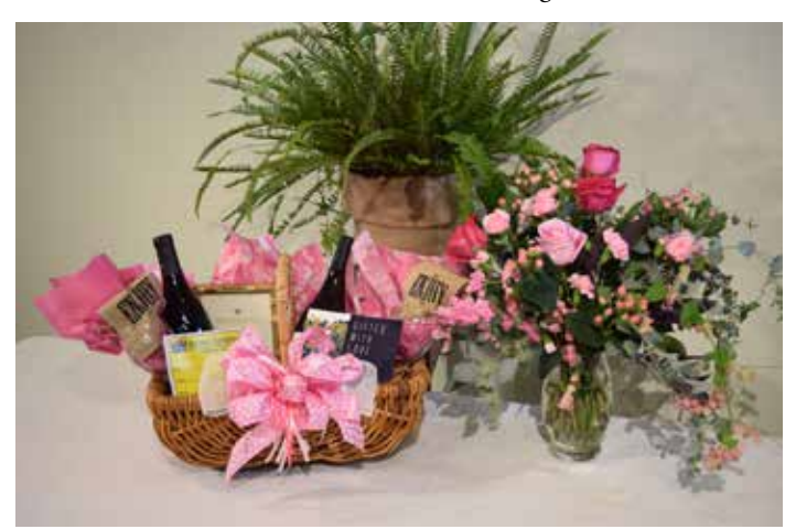
Family Photography Basket: Featuring Kaela Rodehorst