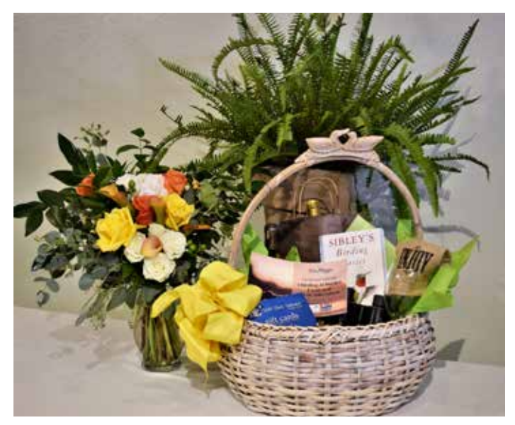
Guided Birding at Burden Basket

We have added a special twist to the annual Wine and Roses fundraiser — a virtual raffle. The Friends of LSU AgCenter Botanic Gardens at Burden have designed 20 themed baskets. Each basket has two wine glasses, a bottle of wine and a bouquet of roses. In addition, each basket will include a variety of items to go with its theme, such as a birding basket, Louisiana artist basket, a picnic at Burden basket and a wellness basket, just to name a few. You can purchase raffle tickets by visiting the LSU AgCenter Botanic Gardens website, Isuagcenter.com/botanicgardens. The website includes a photo and a description of each basket. Ticket prices start at $25 for one ticket, 15 for $200 and 30 for $300. Don't miss this opportunity to sit back, sip some wine and support the LSU AgCenter Botanic Gardens.