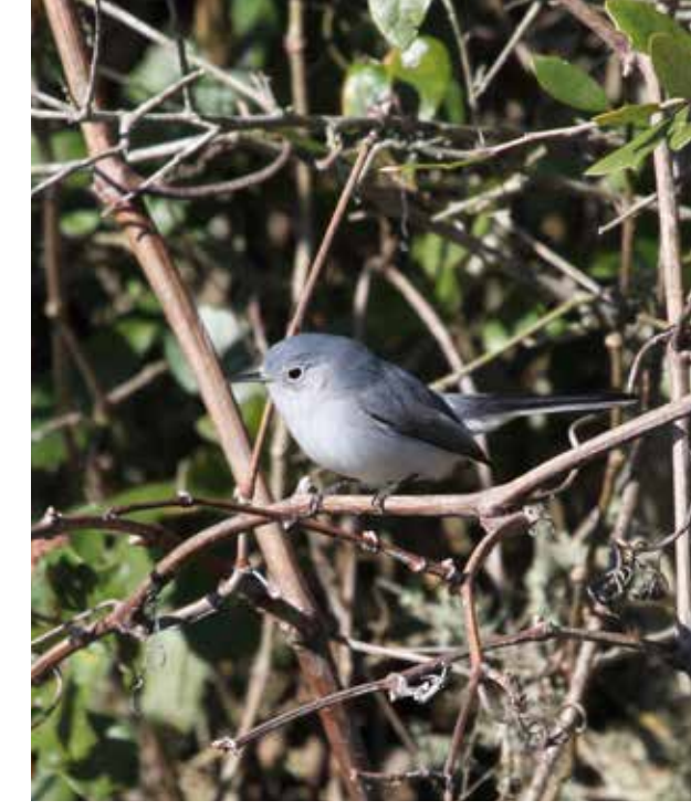
Blue-eyed gnatcatcher.

The forested Trees and Trails Loop (3.0 miles) includes the Mosaic Boardwalk at Black Swamp, Barton Arboretum and its pond, and a birder's secret destination, the Burden brush pile! At Black Swamp, watch for prothonotary warblers in summer and yellow-rumped warblers in winter. Listen carefully for the call of red-shouldered hawks and the drumming of up to seven species of woodpeckers. The brush pile is active year-round but attracts a variety of migratory sparrows in winter.