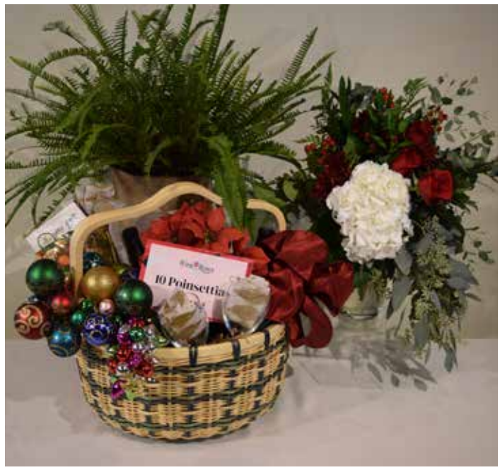
LSU AgCenter Poinsettia Basket