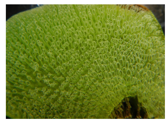
Figure 7. Egg beater shaped hairs of a giant salvinia frond.

Current research now focuses on improving the management of giant salvinia in temperate regions. Researchers have begun comparative analysis of the cold tolerance of salvinia weevils from geographically distinct populations throughout the world. Similarly, the physiology and cold tolerance of salvinia weevils collected from temperate areas of the insect's native range is being investigated. If weevils better adapted to cold winters can be isolated, researchers plan to rear and release this ecotype throughout