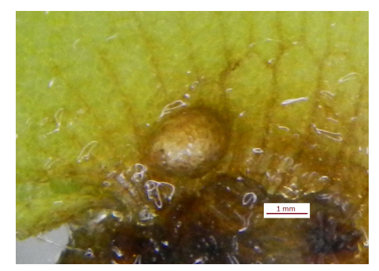
Figure 5. Pupa of the salvinia weevil.