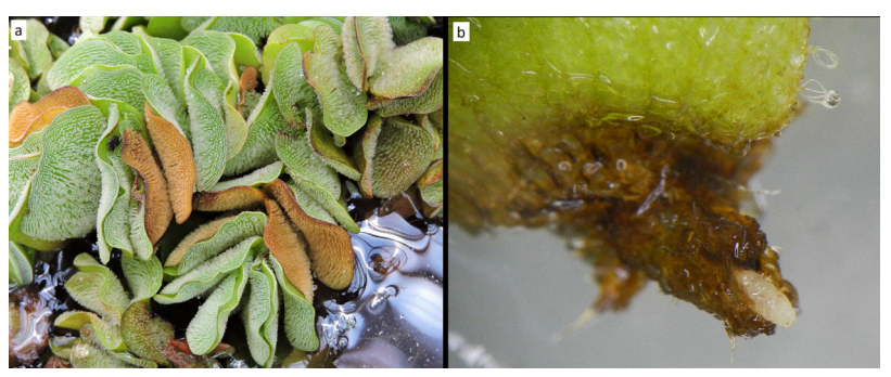
Figure 9. (a) Browning of giant salvinia fronds is indicative of feeding injury produced by the larval growth stage of the salvinia weevil. (b) Salvinia weevil larva tunneling into the rhizome of giant salvinia.