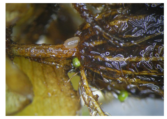
Figure 3. Egg of the salvinia weevil, located above the submerged frond.

Extensive host range experiments and field observations in the native range demonstrated that the salvinia weevil can only survive on plant species in the genus Salvinia . In the United States, the salvinia weevil feeds and reproduces exclusively on two invasive plants: giant salvinia and common salvinia ( Salvinia minima Baker). Giant salvinia can be differentiated from common salvinia by the presence of egg beater shaped hairs on the leaf of the plant (Figure 7). Common salvinia leaf hairs do not conjoin at the tip to form the egg beater shape.