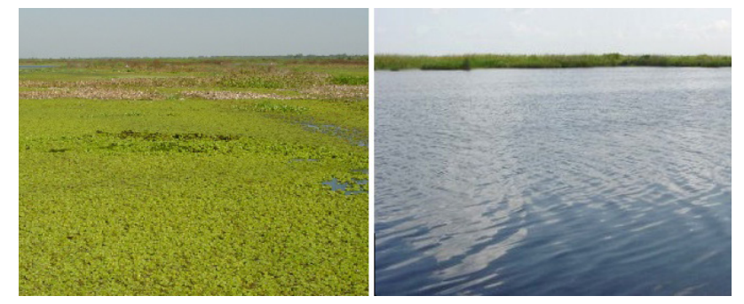
Figure 10. Giant salvinia infestation in Lafourche Parish, Louisiana, before and after release of salvinia weevils.