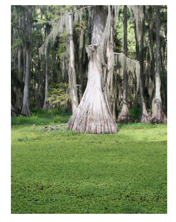
Figure 1. Giant salvinia infestation in Bienville Parish, Louisiana, 2011.

In the United States, giant salvinia has been reported in Alabama, Arizona, California, Florida, Georgia, Hawaii, Louisiana, Mississippi, North Carolina, Oklahoma, South Carolina, Texas and Virginia (Figure 2). The largest infestations have been reported in