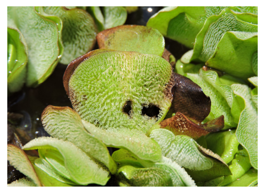
Figure 8. Characteristic shotgun hole feeding pattern of the adult salvinia weevil on giant salvinia.