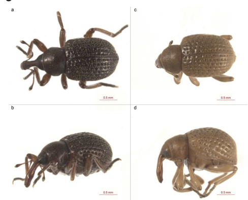
Figure 6. Adult salvinia weevils. (a) Dorsal view of a mature weevil, (b) Lateral view of a mature weevil, (c) Dorsal view of a teneral weevil, (d) Lateral view of a teneral weevil.