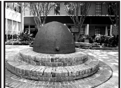
Etienne de Boré