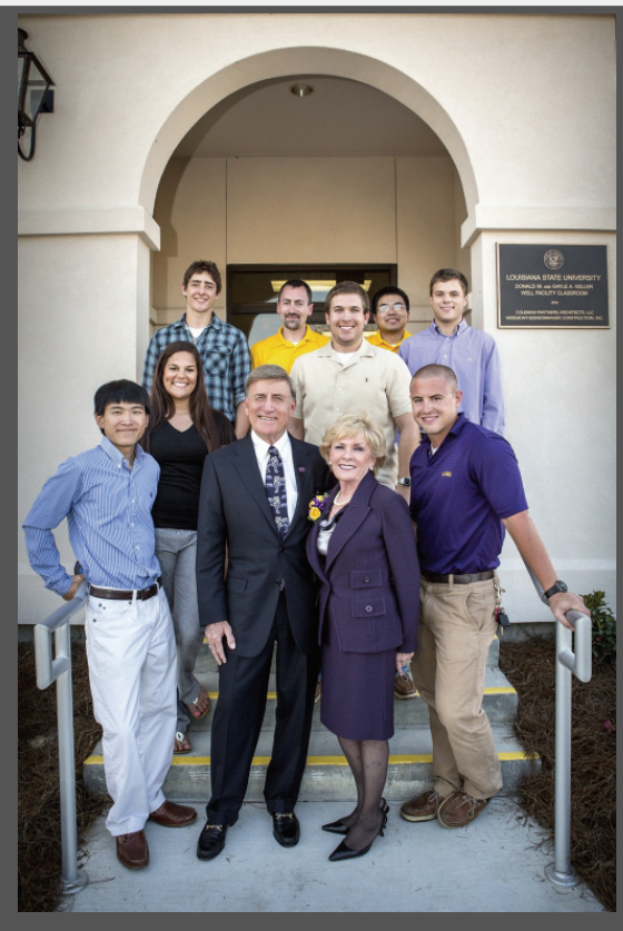
The Kellers stand in front of the Keller Classroom Building with a number of the students who were the first to benefit from this generous contribution to our one-of-a-kind facility.

control with real equipment and realistic situations, rather than relying on the use simulators, during two laboratory courses taught at the PERTT Lab. Faculty also benefit from the ability to conduct and learn from research completed using the full-scale systems at the lab, and industry conducts a wide range of testing and training at the lab.