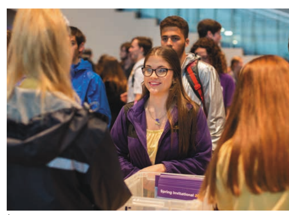
SPRING INVITATIONAL CHECK IN